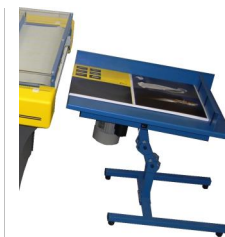
Optional Jogger 530

Because the quality of lamination depends on a combination of many factors (film and paper quality, printing technology being used, etc.), the actual speed of operation will vary depending on these factors.