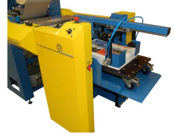
Optional Pallet Stacker