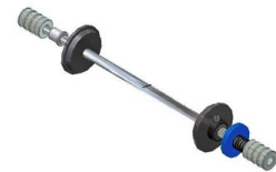
Extra Film Supply Roll Shaft

Winding device that allows use of metalized film (gold, silver, red, etc.) and spot varnish film. The machine behaves as semi-automatic during foiling because there is no need for separation.